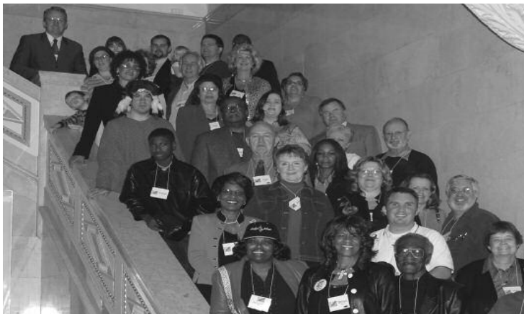
Alumni Reunion 2008- Pink Palace Museum

Graduates of MTS, The Cumberland Presbyterian Seminary in McKenzie, and the Program of Alternate Studies (PAS) are eligible as alumni to join the MTS Alumni Association. Benefits of membership are available through the Alumni Affairs Department. Annual dues are $20 or $100 lifetime.