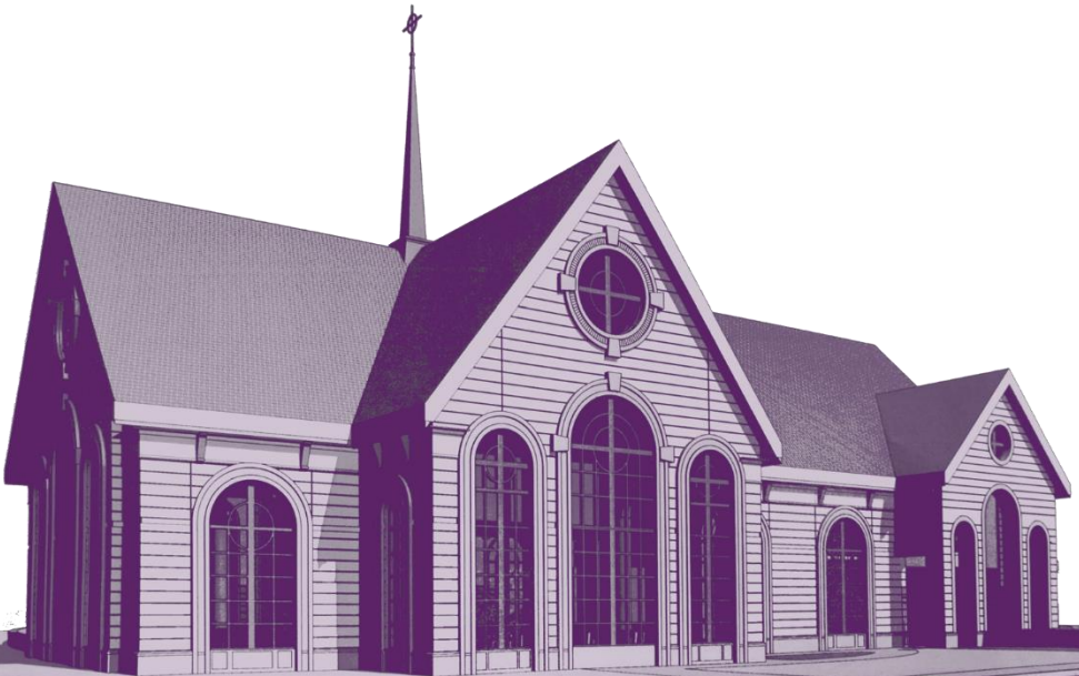
Architectural Rendering of New Chapel

This reference guide contains current policies, procedures and academic curricula of the seminary. The seminary reserves the right to make necessary changes in regulations and policies during a given year but will not do so without due notice to students, faculty and staff.