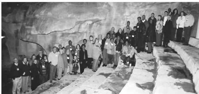
Alumni Reunion 2007—Memphis Zoo

Graduates of MTS, The Cumberland Presbyterian Seminary in McKenzie, and the Program of Alternate Studies (PAS) are eligible as alumni to join the MTS Alumni Association. Benefits of membership are available through the Alumni Affairs Department. Annual dues are $20 or $100 lifetime.